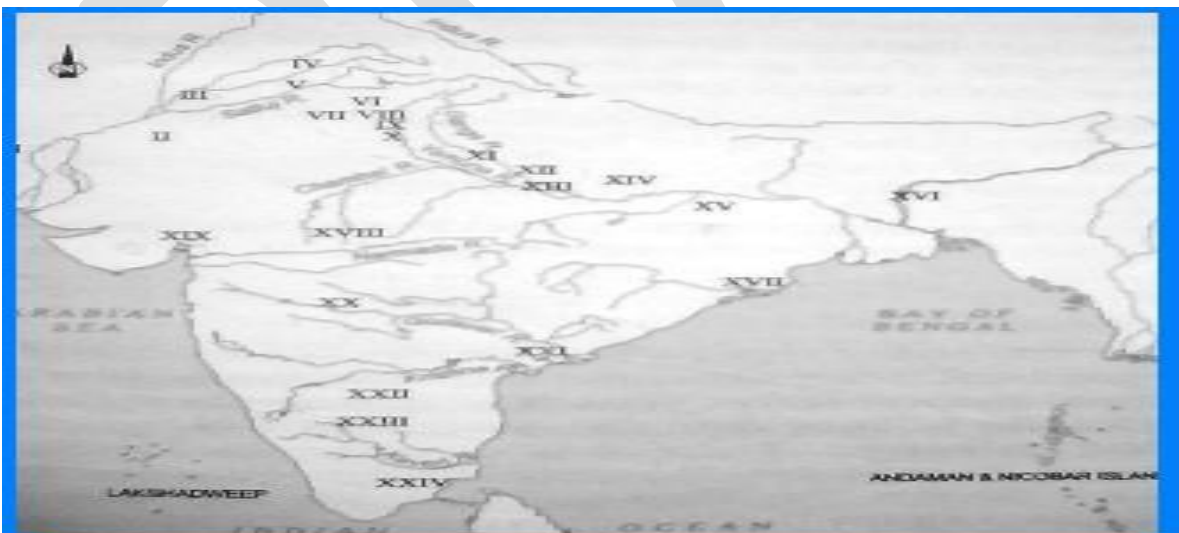
Provinces of the Delhi Sultanate during Muhammad Tughluq's region according to the Egyptian source Masalik al-Absar fi Mamalik al-Amsar of Shihabuddin Umari.