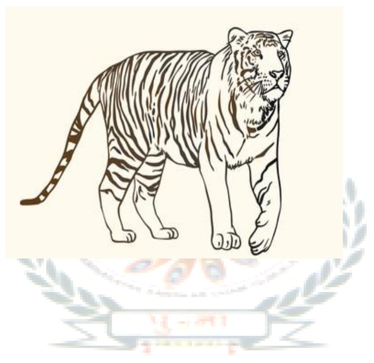
Activity Paper pasting.