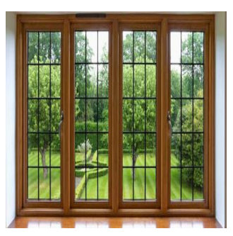
K __ t ___ h ___ n