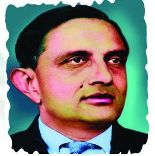
Dr. Vikram Sarabhai