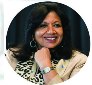
Kiran Mazumdar Shaw