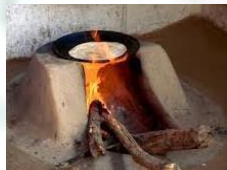
2. Wood and and Cow dung cake