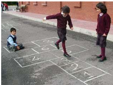
Stappoo (Hop scotch)