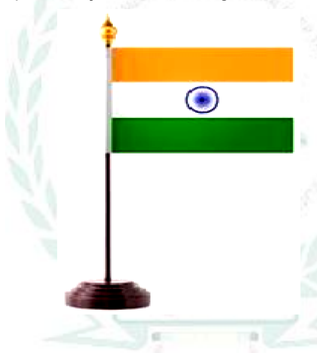
{\bf Q} 10. Draw the picture of our national flag , write name and colourit.