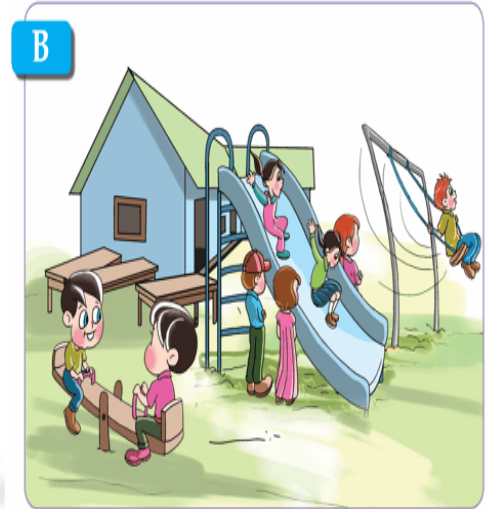
swings, slide, see-saw, children, benches