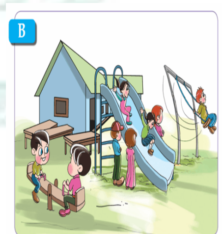
swings, slide, see-saw, children, benches