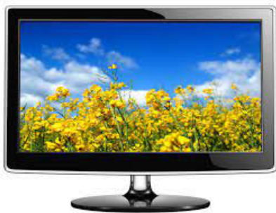
10. Television Toothbrush