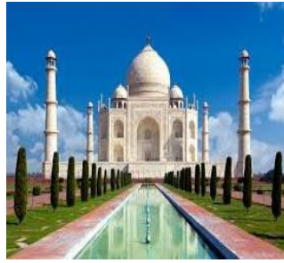
2. Taj Mahal