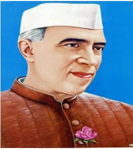
1. Jawahar Lal Nehru

Q.6 Look at the pictures and identify the following.