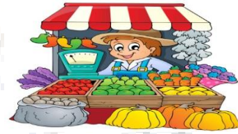
Vegetable - seller